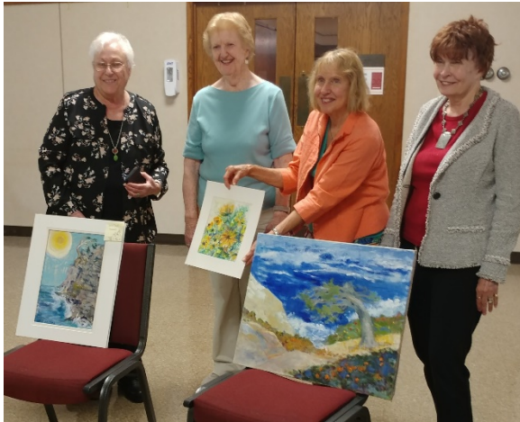
Saturday May 15 th Branch Meeting at Silverside Church